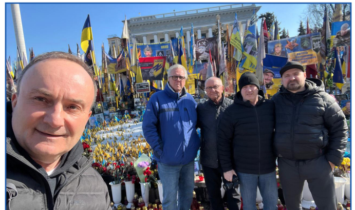
Cemeteries everywhere with flags and memorials

midst of war. Together, we are making a difference one life, one family and one community at a time.