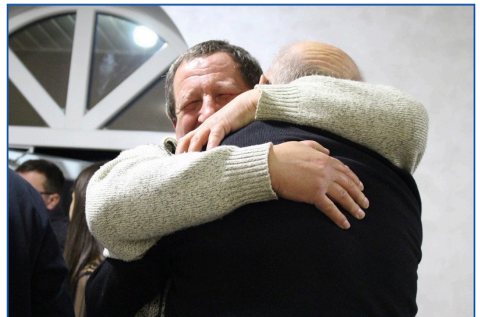
Overwhelmed with gratitude

Because of your generosity, Master's Foundation continues to stand with the people of Ukraine. Your support today helps bring relief and encouragement to those living in the