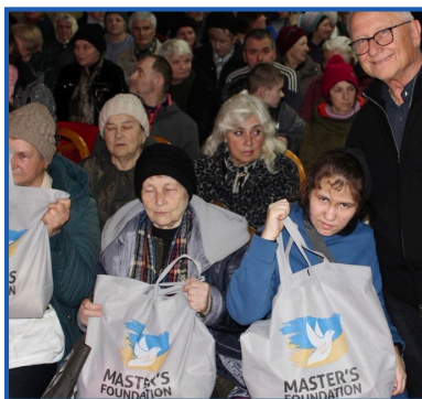
Master's blessing bags

Everywhere we went, mothers came asking for prayer for their husbands and sons serving on the frontlines. We also heard many stories of hardship, sorrow and loss. But in the midst of it all, we saw faith in action with hearts and hope being restored.