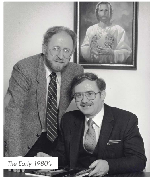
The Early 1980's

Stan's passing marks the end of this era, but the work of Master's Foundation continues. With the war that continues to rage, help for Ukraine is needed even more. Stan's calling is now our calling, and our biggest tribute to him is for each of us to continue to serve the wonderful people of Ukraine.