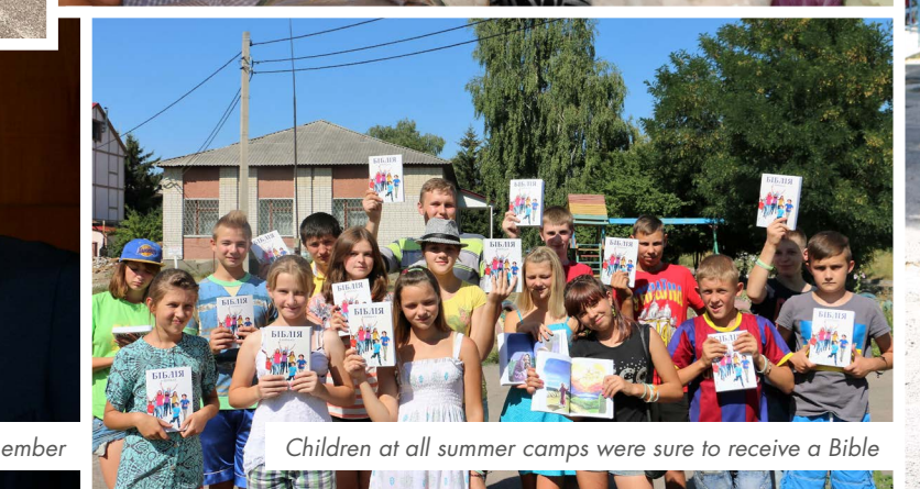
Children at all summer camps were sure to receive a Bible